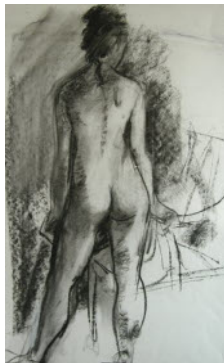
Standing Nude by Barry Elphick charcoal - Issue 8

We welcome lively, contemporary writing: poems, short stories, articles and extracts from novels which stand on their own - all of which should have a French connection.